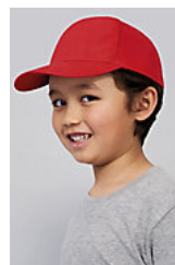
SOL'S SUNNY KIDS 88111