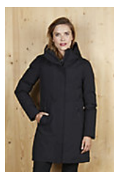
NEOBLU ALFI WOMEN 04005