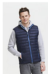
SOL'S WAVE MEN 01436