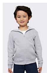
SOL'S STONE KIDS 02092