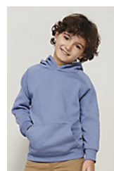
SOL'S STELLAR KIDS 03576