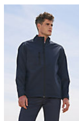
SOL'S RELAX 46600