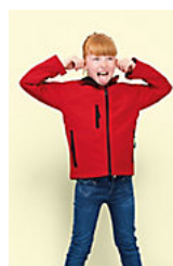
SOL'S REPLAY KIDS 46603