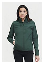
SOL'S RADIANT WOMEN 03107